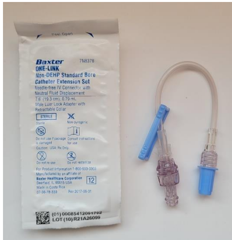
One Link Needleless Catheter Extension Set