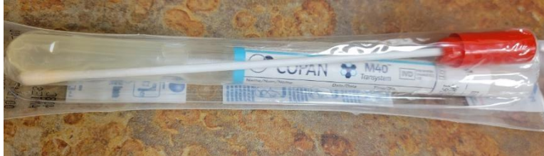
Sterile Culture & Sensitivity (C&S) Swab