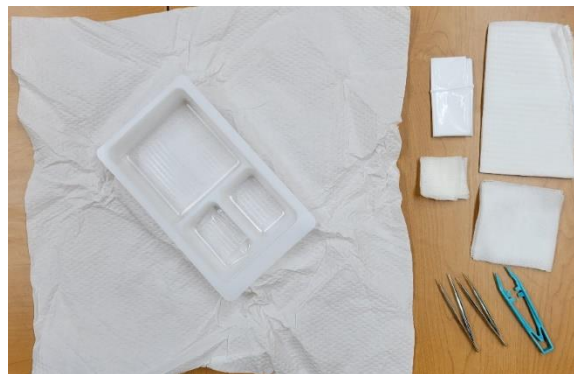
Internal Contents of Sterile Dressing Tray