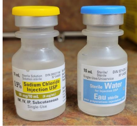
Sterile Solution Vials