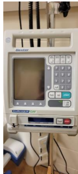
Single Channel Baxter Colleague IV Pump