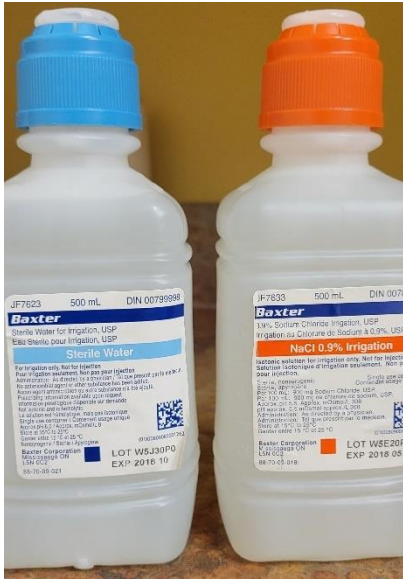
Sterile Solution Bottles