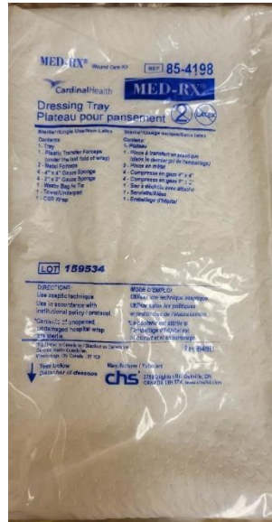
External Package of Sterile Dressing Tray