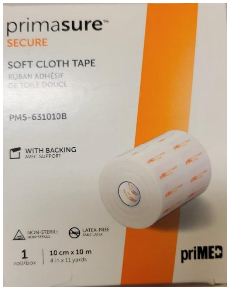
Prima Sure / Mefix Soft Cloth Tape