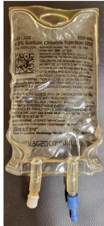
100 mL IV Mini-Bag