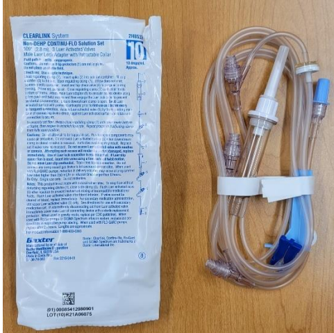
Clear Link System Primary IV Tubing