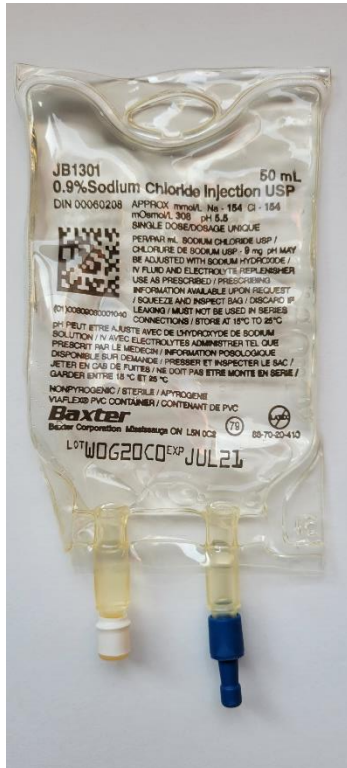
50 mL IV Mini-Bag