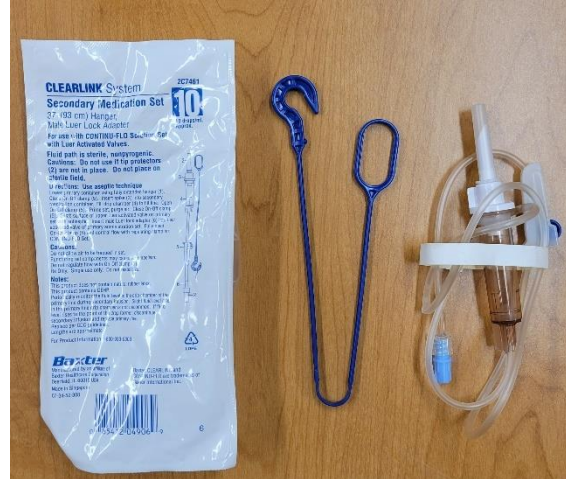
Clear Link System Secondary IV Tubing